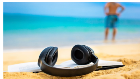
photo: headphones and book on the beach, ocean in the background

Thank you to the TBS patrons who participated in the summer reading program. (You'll receive your prizes very soon!) We'll do it again next year.