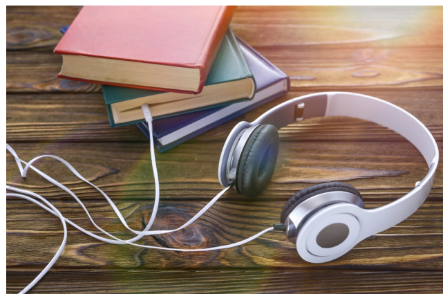
photo: headphones and books