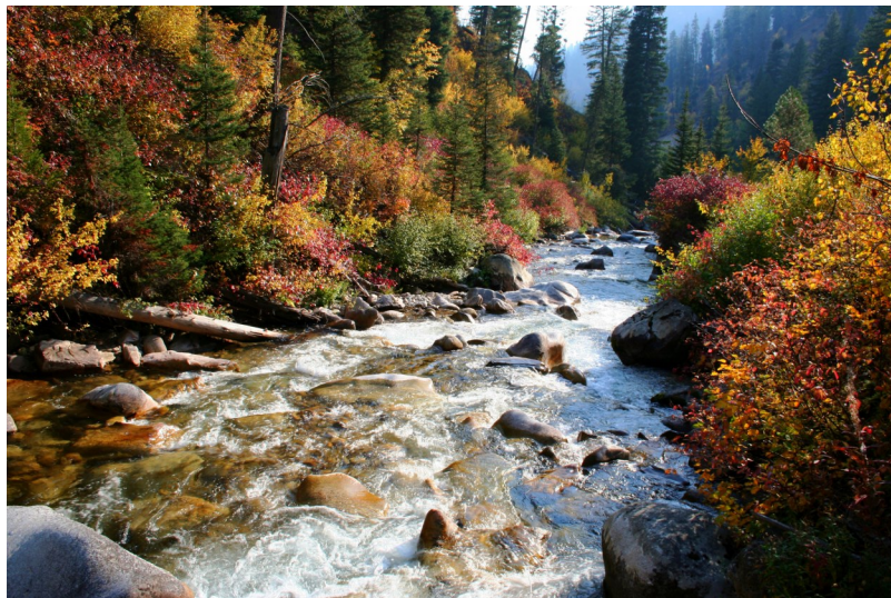
photo: river with fall foliage along the banks