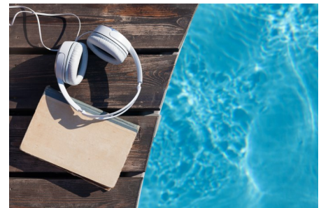
photo: headphones, book, swimming pool

At the end of the summer, send in your form via mail or email. Or just call the Idaho TBS and let us know you've completed the challenge. You will receive a reading certificate and a prize. Happy summer reading!